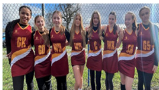
Girls Netball PGL